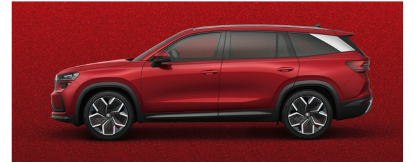
Velvet Red metallic