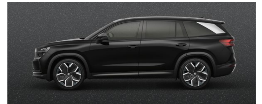
Magic Black metallic