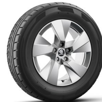
17" Paget Aero silver alloy wheels