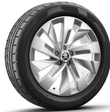
19" Rapeto silver Aero alloy wheels