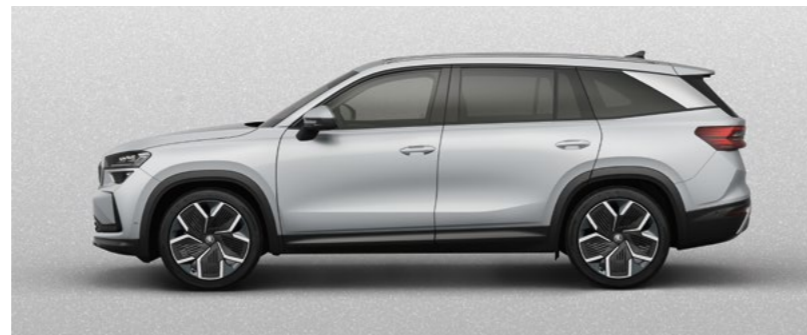
Brilliant Silver metallic