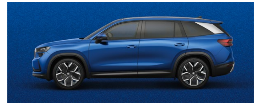
Race Blue metallic