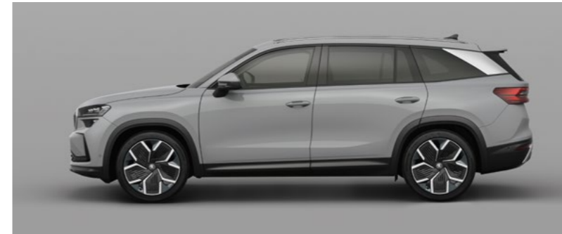
Steel Grey uni