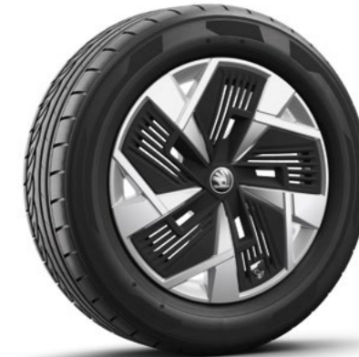
18" Mazeno Aero silver alloy wheels with black Aero covers