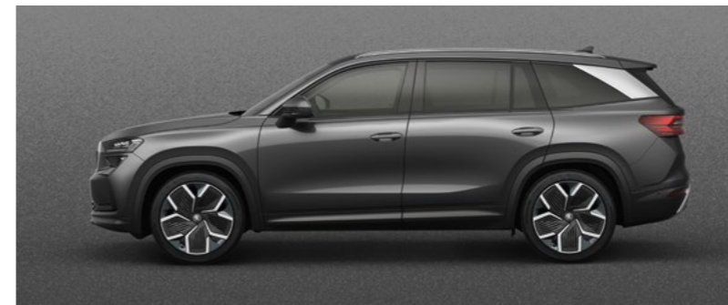
Graphite Grey metallic