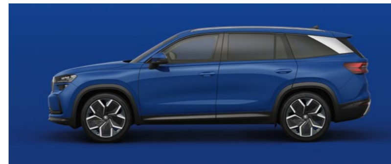
Energy Blue uni