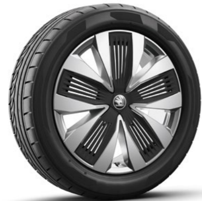
19" Talgar Aero silver alloy wheels with black Aero covers