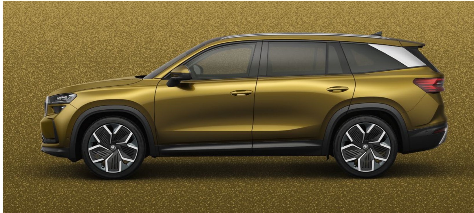
Bronx Gold metallic