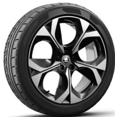
20" Elias alloy wheels