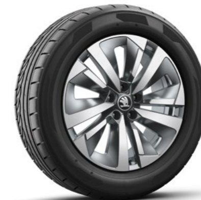
18" Soira Aero anthracite alloy wheels