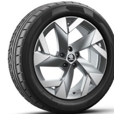
19" Tirsuli Aero anthracite alloy wheels*