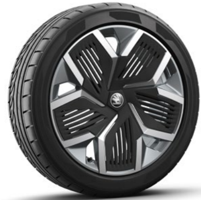
20" Rila Aero anthracite alloy wheels with black Aero covers